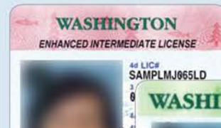
Current Enhanced Driver License and ID Card