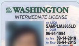
Current Adult and Minor Driver License

CURRENT FORMATS - Washington's current Driver License, Enhanced Driver License and Identification Cards are still valid until they expire or you come in for a new document. There is no need to renew until your license expires.